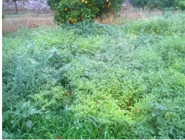
Figure 2. Intercropping between oranges near Chania in Crete