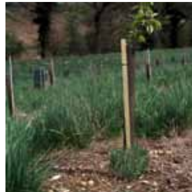
A tree weeded in a 'polo mint' shape is less susceptible to pecking around the roots