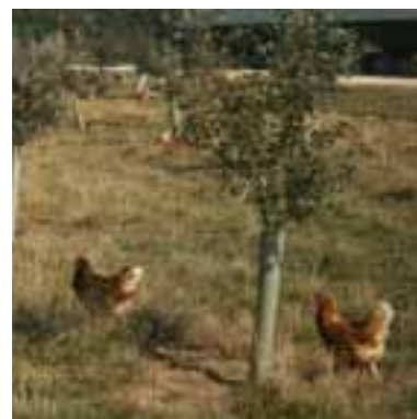
Within a few years, the young trees will start to provide shade and shelter