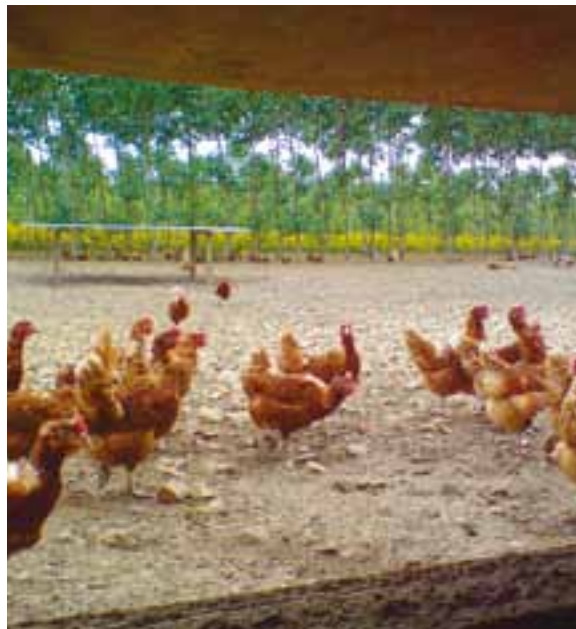
Trees provide an attractive view from the pop-holes and encourage birds outside by providing foraging under natural shelter, away from wind and predation