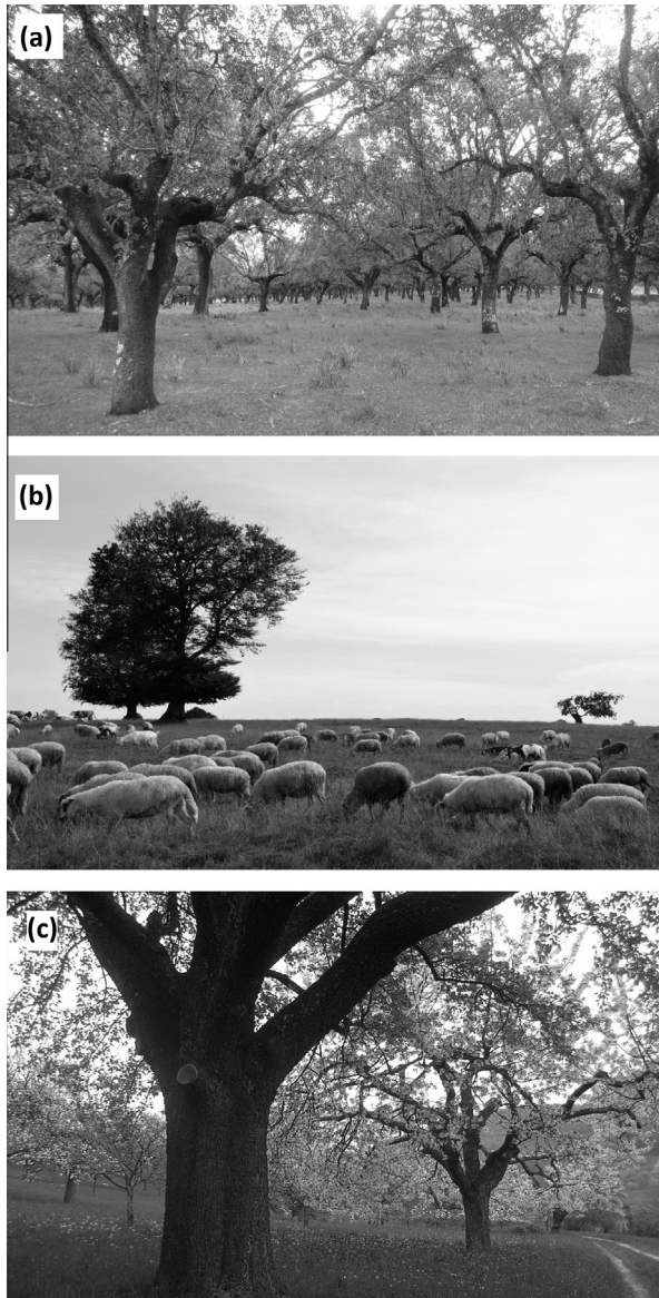
Fig. 1. Examples (from top to bottom) of (a) pastures in open woodlands (Dehesa with Quercus ilex in Torrecillas de la Tiesa, Spain), (b) pastures with sparse trees (pasture with scattered Fagus sylvatica trees in Eastern Transylvania, Romania), and (c) pastures with cultivated trees (orchard meadow in Lenningen, Germany).

the polygons), which produced very similar results (data not shown).