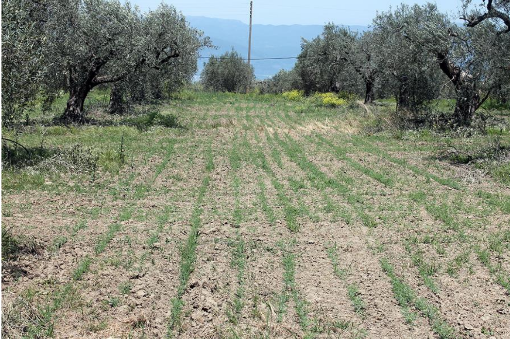
Figure 1. Intercropped area in an olive grove